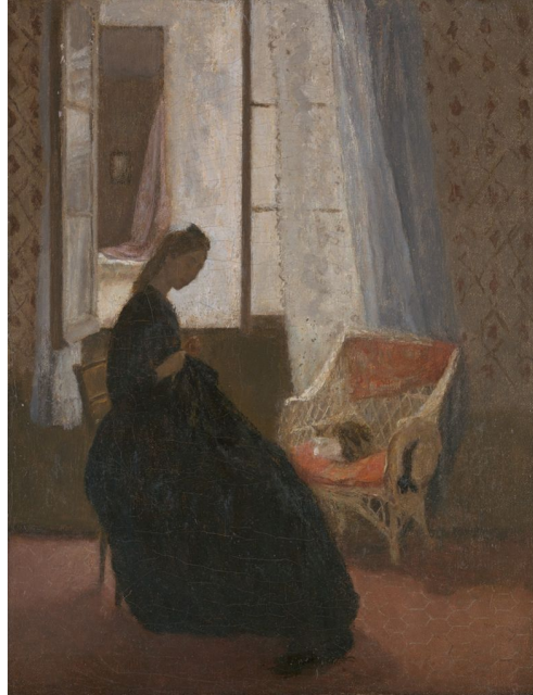
Fig. 1. Gwen John, La Chambre sur la Cour , 1907-1908, Oil on canvas. Yale Center for British Art, Paul Mellon Collection.