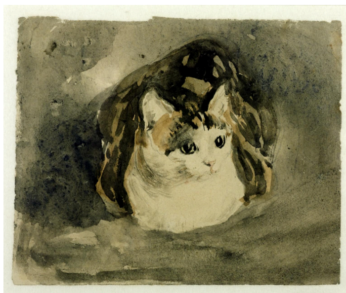
Fig. 2. Gwen John, Cat , c. 1904-1908, Watercolour, 11.5 × 14 cm. London, Tate Gallery.

The artist acquired her in 1904, while living at 19 bvd Edgar Quinet, and named her after that address (for a comparable work, see Fig. 2). The cat disappeared twice, the second time - in 1908 - permanently. For other comparable drawings see nos. 175-182, Ibid.